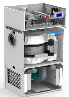
ML with Climatix Controls