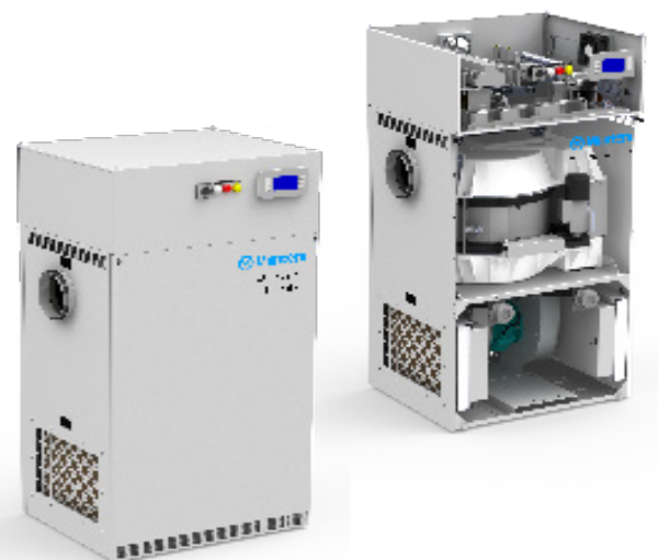
ML with Climatix Controls

ML Series dehumidifiers conform to both harmonised European Standards and to CE marking specifications