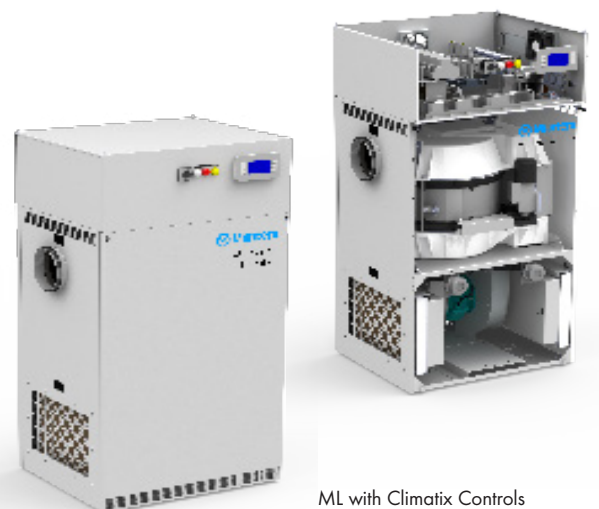
ML with Climatix Controls

ML Series dehumidifiers conform to both harmonised European Standards and to CE marking specifications