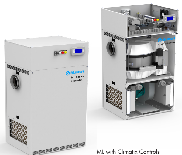
ML with Climatix Controls

ML Series dehumidifiers conform to both harmonised European Standards and to CE marking specifications