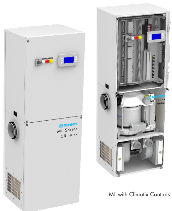
ML with Climatix Controls

ML Series dehumidifiers conform to both harmonised European Standards and to CE marking specifications