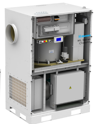
ML with Climatix Controls