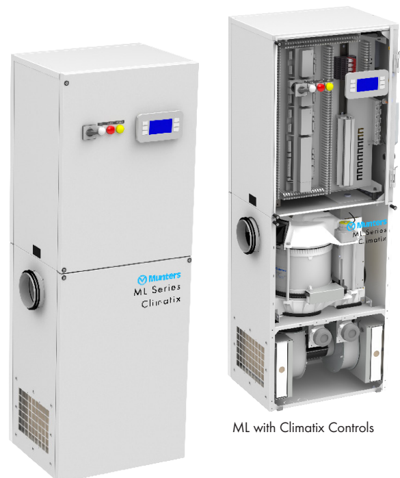
ML with Climatix Controls

ML Series dehumidifiers conform to both harmonised European Standards and to CE marking specifications